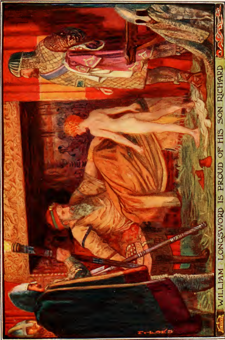
WILLIAM LONGSWORD IS PROUD OF HIS SON RICHARD